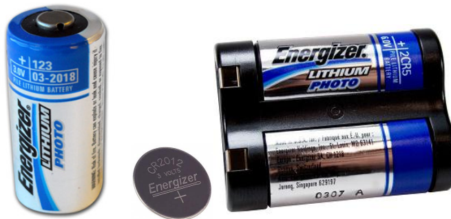
Figure 1 - Example of Lithium Metal Cells and Batteries

Lithium metal batteries packed by themselves (not contained in or packed with equipment) (Packing Instruction 968) are forbidden for transport as cargo on passenger aircraft). In accordance with Special Provision A201, lithium metal cells or batteries that meet the quantity limits of Section II of PI 968 may be shipped on a passenger aircraft under an approval issued by the authority of the State of Origin, State of Destination and State of the Operator. Or in the case of urgent medical need, one consignment of lithium batteries may be transported as Class 9 (UN 3090) on passenger aircraft with the prior approval of the authority of the State of origin and with the approval of the operator, see Special Provision A201. All other lithium metal cells and batteries can only be shipped on a passenger aircraft under exemption issued by all States concerned.